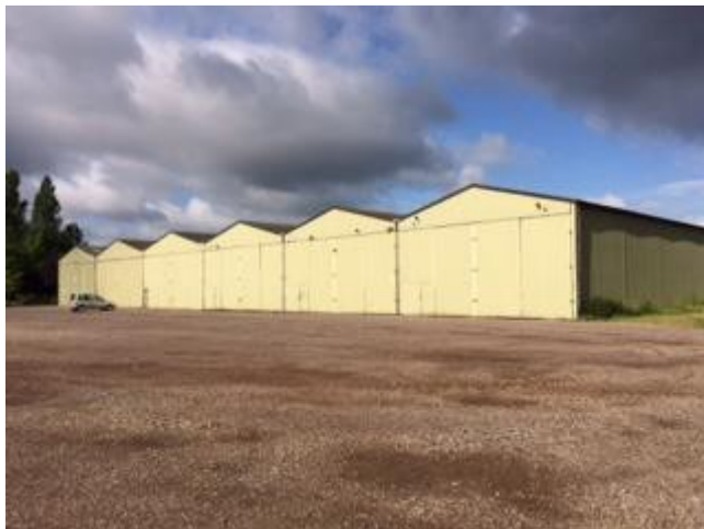
Photo – Butler Carnival Park in Glastonbury

Whilst similar facilities exist, the best of which is shown below (Butler Carnival Park, Glastonbury), none are in the local area where clubs from the South Somerset Federation could take advantage of the facilities offered.