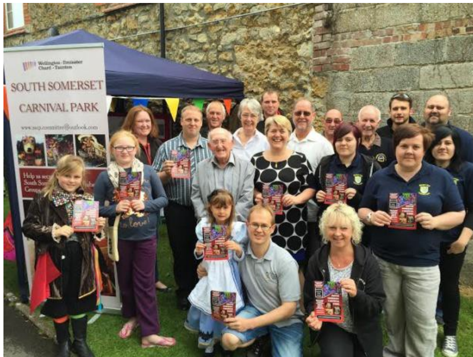
Photo – SSCPC members raising awareness