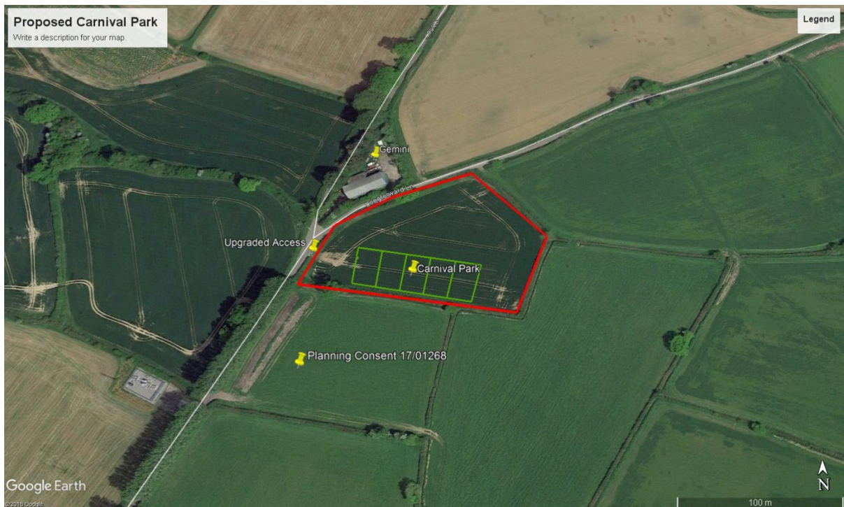
Above – proposed location of Carnival Park